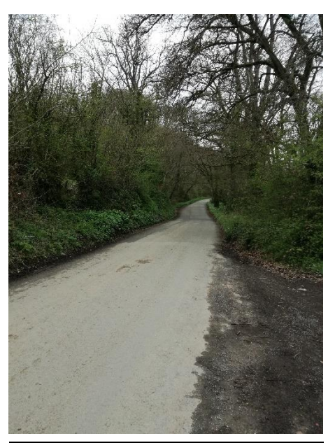
RUSH HOUR ON THE WAY TO TAWSTOCK

Bideford, also known as the Little White Town, is associated with Charles Kingsley who wrote Westward Ho! and the Water Babies. The pedestrianised high street boasts a number of interesting independent shops, including a Christian bookshop. From the quay you can travel to the island of Lundy by boat.