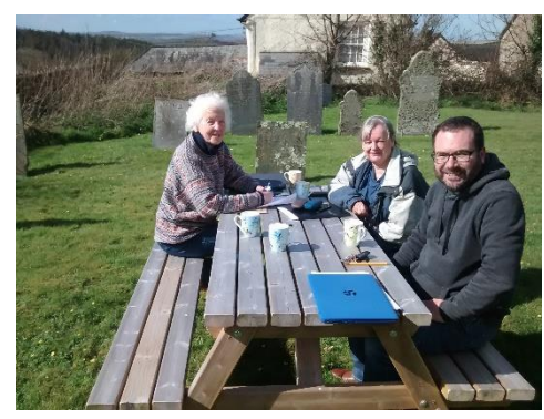
HUNTSHAW PCC MEETING IN CHURCHYARD... IT WAS WARMER THAN IN THE CHURCH!

The role of the training incumbent is to support the curate in this training experience. This will primarily be through a working relationship in which the incumbent and curate pray together, learn together and share ministry together. At times the curate will learn by observing or sharing ministry with the incumbent, or others. At other times the curate will lead, with the support of the incumbent who will then reflect with the curate on the ministry undertaken.