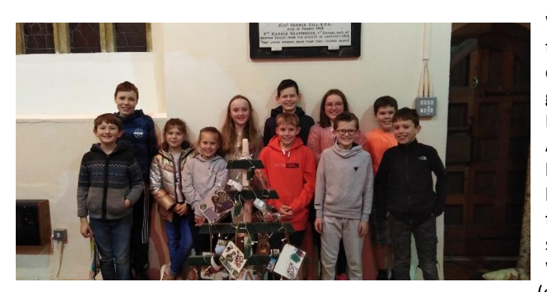
THE YOUTH GROUP IN NEWTON TRACEY

Our emphasis is on helping each parish to thrive. This means providing some ministry at mission community level which parishes can access. We provide most training at mission community level, although we also offer more personal or targeted training locally. Some activities which take place across the whole mission community are marriage prep, confirmation prep and special events such as involvement in Thy Kingdom Come.