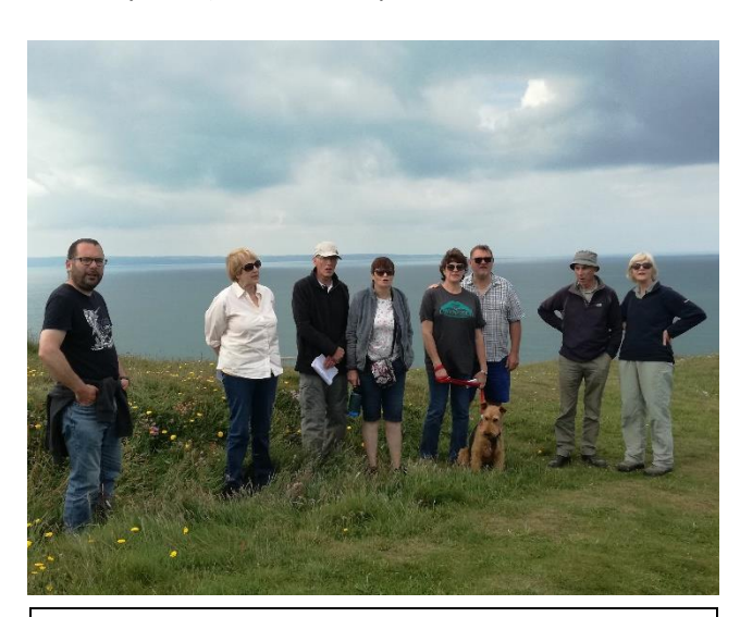
PRAYER WALKING THE SOUTH WEST COAST PATH AS PART OF THY KINGDOM COME

Barnstaple provides leisure facilities including a Leisure Centre, a cinema and a theatre. In the centre of the town there is a Victorian Pannier Market. Adjacent to the Market is historic Butchers Row, a row of specialist food shops, some still open fronted. Barnstaple has a direct railway link to the cathedral city of Exeter, The Tarka Line, and a link road that takes you to the M5 motorway in under an hour.