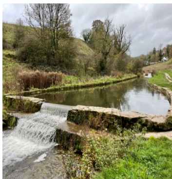
Youlgrave has a swimming pool for wild swimming – very popular in the warmer months!