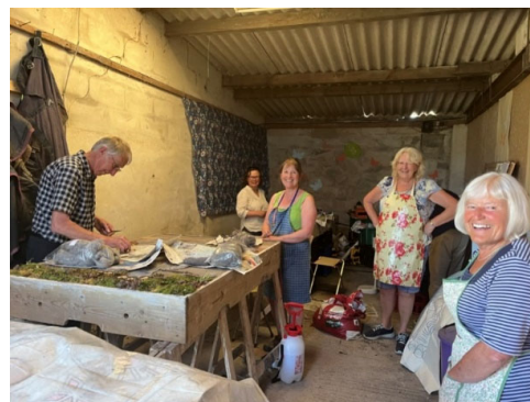
Well Dressing preparations underway in a local garage.