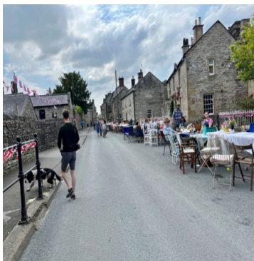
The Jubilee celebrations in Youlgrave