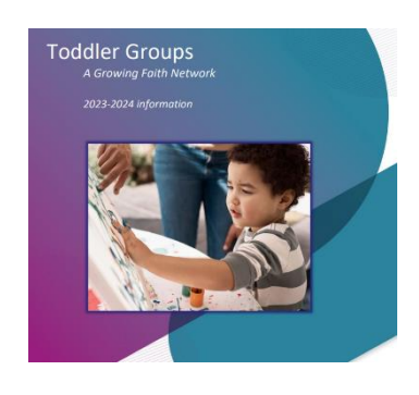
Toddler Groups Network

Toddler group leaders are at the heart of Growing Faith: home-church-school! A new network for these colleagues (and their church leaders) starting in September. Please invite toddler leaders you know to sign up here!