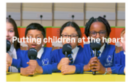
Putting children at the heart