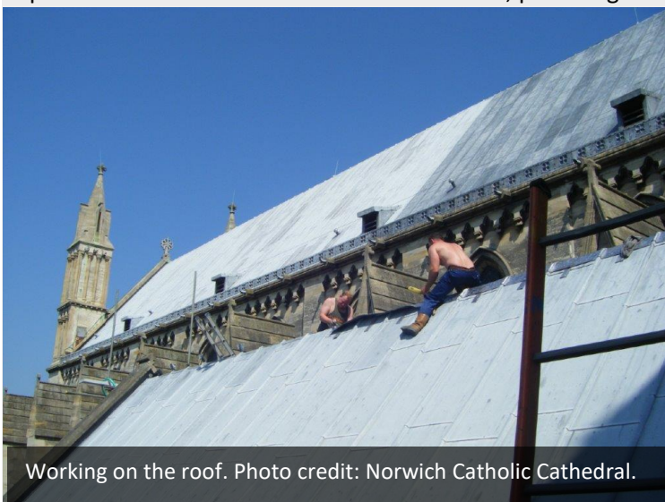
Working on the roof.

Norwich is the second largest Catholic cathedral in England, after Westminster. It was constructed between 1882 and 1910 to designs by George Gilbert Scott Jr. as a parish church dedicated to John the Baptist, on the site of the Norwich City Gaol. The funds for its construction were provided by Henry Fitzalan-Howard, 15th Duke of Norfolk, as a gift to the Catholics of Norwich as a sign of thanksgiving for his first marriage to Lady Flora Abney-Hastings. In 1976, it was consecrated as the cathedral church for the newly erected Diocese of East Anglia and the seat of the Bishop of East Anglia. The Narthex, a modern development including a café, shop, garden and function rooms, opened in 2010 as the cathedral's 'front door', providing a welcome to all.